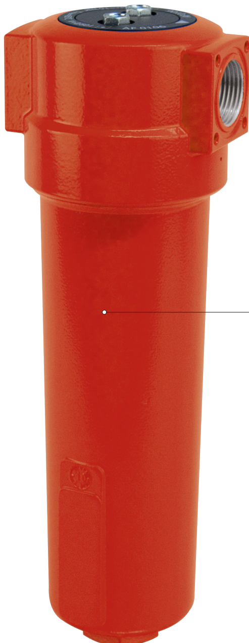
Ms; 0,1 µm

To meet the required compressed air quality appropriate "paint compatible" filter element must be installed into filter housing.